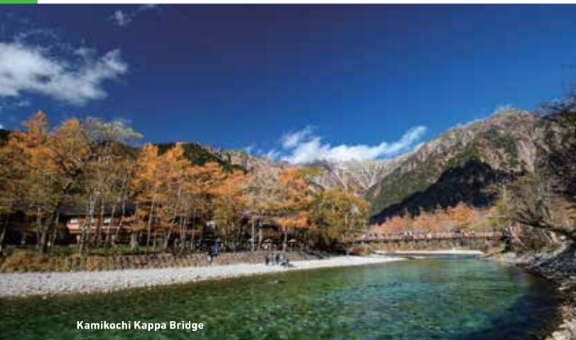
Kamikochi Kappa Bridge

Tour Dates > 2024 Sep. 29 th SUN / 30 th MON / 2024 Oct. 1 st TUE / 2 nd WED