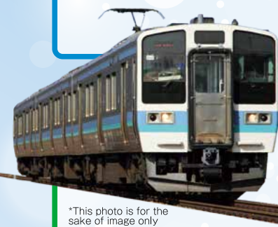
*This photo is for the sake of image only

▲ Please combine the timetables above and below to suit your own schedule. ▼