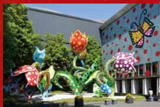
"Visionary Flowers" 2002 and "From Matsumoto to the Future" 2016 - both art works by Yayoi Kusama.

Nakamachi-dori shopping street retains numerous traditional Japanese warehouse structures characterized by white walls crisscrossed by raised black tiles. Enjoy a stroll along this quaint townscape as well as shopping. Recommended unique souvenir items are Japanese folk handicrafts and Matsumoto "mingei" (folk-art-style) furniture.