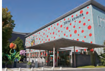
Matsumoto City Museum of Art

*There are some non-participating restaurants and bars.