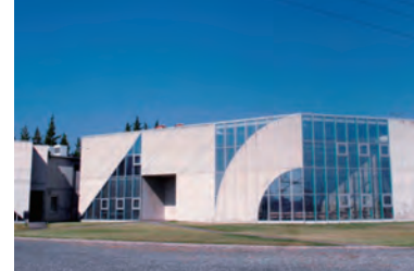
Japan Ukiyo-e Museum